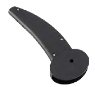
Black plastic cover