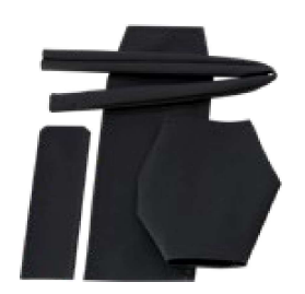
Black leather-look cover 102020