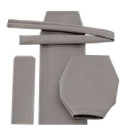
Grey leather-look cover 102022