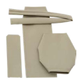
Beige leather-look cover 102023