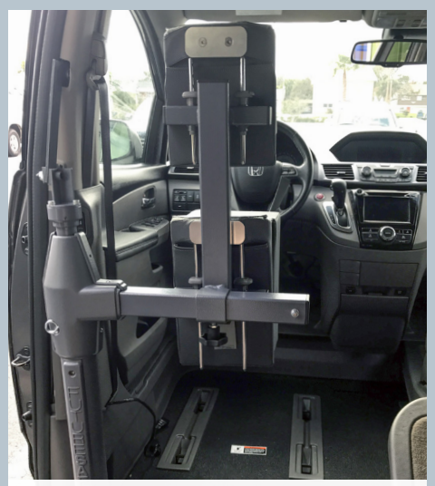
eFutureSafe folded out; suitable for almost all commonn wheelchair types