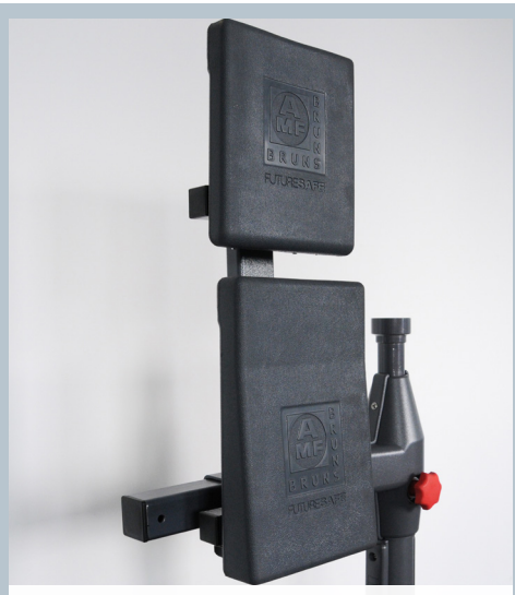
Headrest and backrest are seperately hightadiustanble