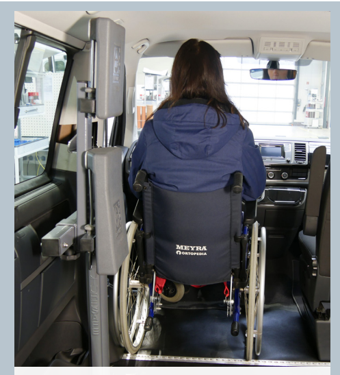
Space-saving swivelled to the side allows acces to the cockpit